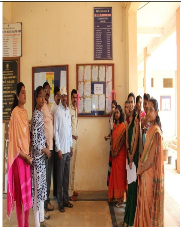
Guest Lecture on 'Gender Equity'