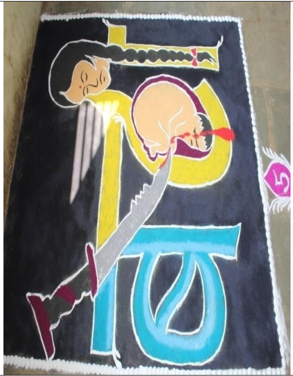
Guest Lecture on 'Gender Equity'